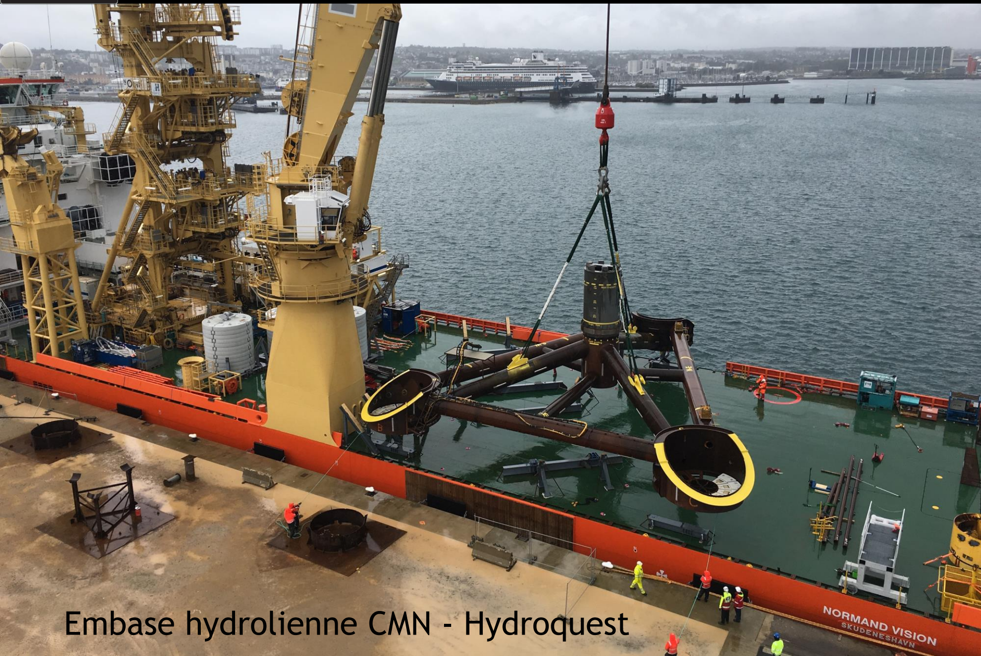
Embaise hydrolienne CMN - Hydroquest