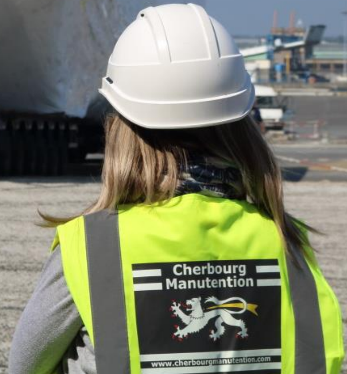
Moule de pale LM Wind